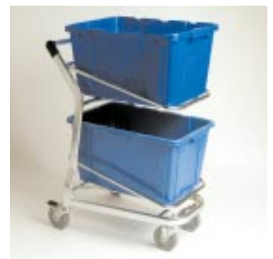
EcoTote cart for recycling bins