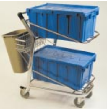
EZtote450 with optional trash can on hook *