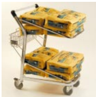
EZtote450 holds up to 500 pounds *