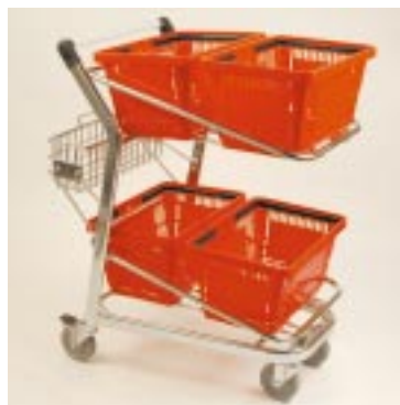
EZtote450 with large baskets for picking, dump bins or returns *