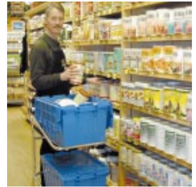
Easy and efficient unpacking