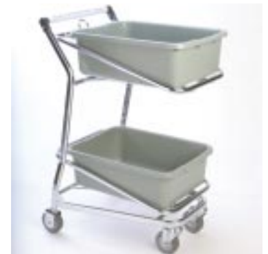
EZtote200 and 300 series carry most sizes of bus tubs