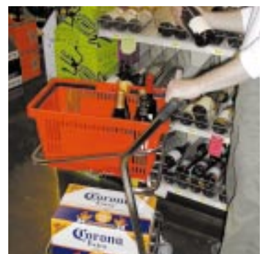
Easily converts hand basket customers to larger purchases