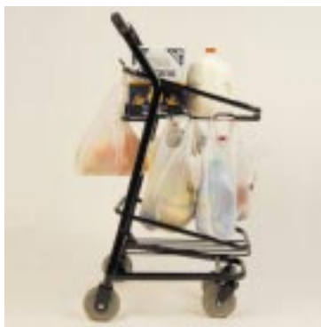
Multiple carrying hooks to hold bags *