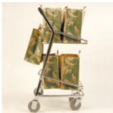
Hand baskets stay in store