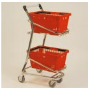
EZcart basket cart with baskets