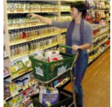
The EZcart allows the customer easy comfortable shopping