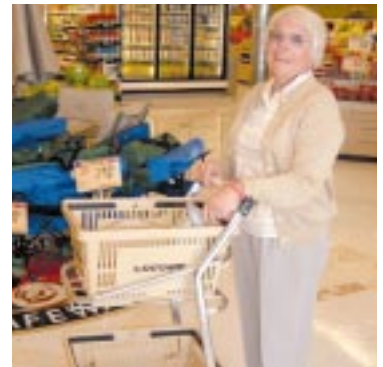
The EZcart makes shopping at your store more attractive to frequent shoppers, singles and senior citizens